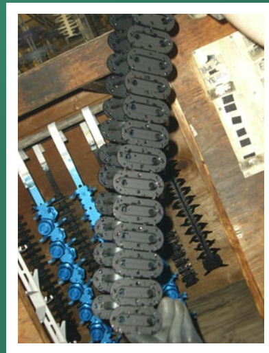
Black dye on 2024 ~ NO PROBLEM!!!