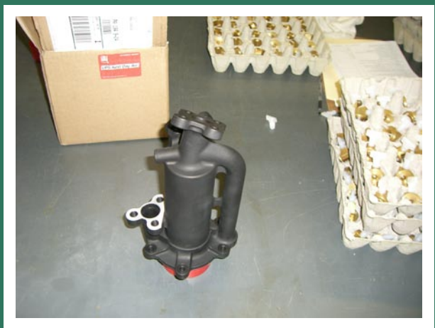
Intricate castings done using ASF