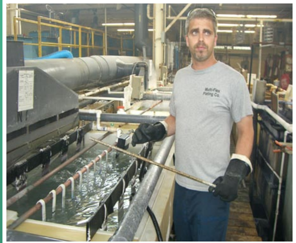
One PAS II~III@ Pending and all work on that bar anodizes at the same ASF